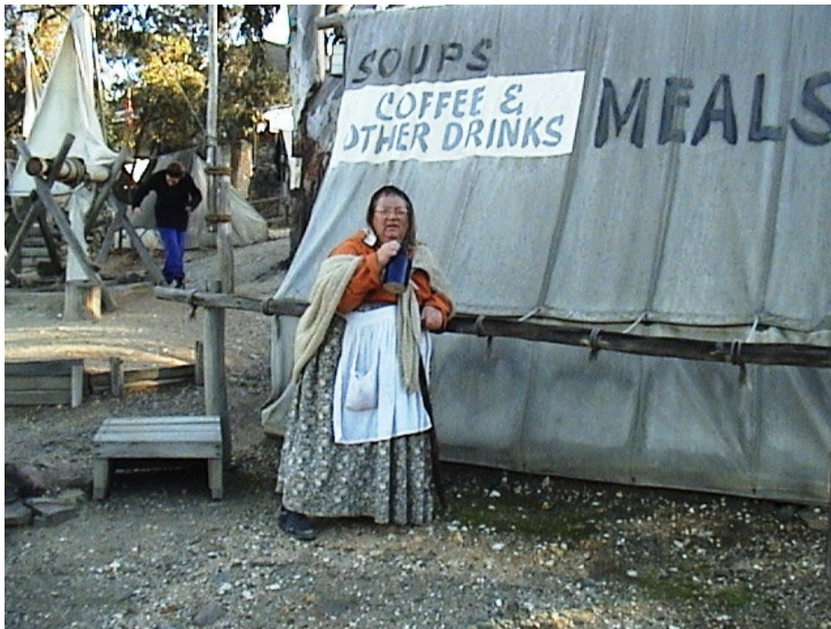
One of Sovereign Hill's volunteers at the Sly Grog Tent

The following pages contain information about people who actually sailed to Australia to become part of the Victorian Goldrushes. Some went back home and some stayed. We know a lot about some and just a little about others.